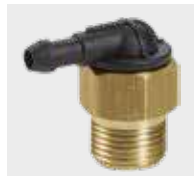
Standard thermostatic valve

Practical retractable handles for helping to lift the machine