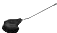
Rotating brush (max 60°C)