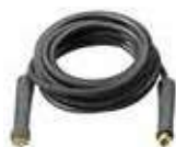
Rubber delivery hose extension kit