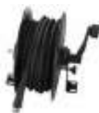
Hose reel kit with rubber hose