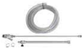
Professional Sand/Soda blasting lance kit